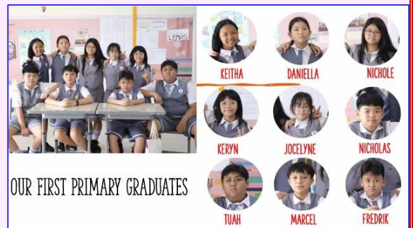
OUR FIRST PRIMARY GRADUATES