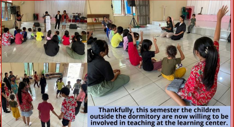
Thankfully, this semester the children outside the dormitory are now willing to be involved in teaching at the learning center.